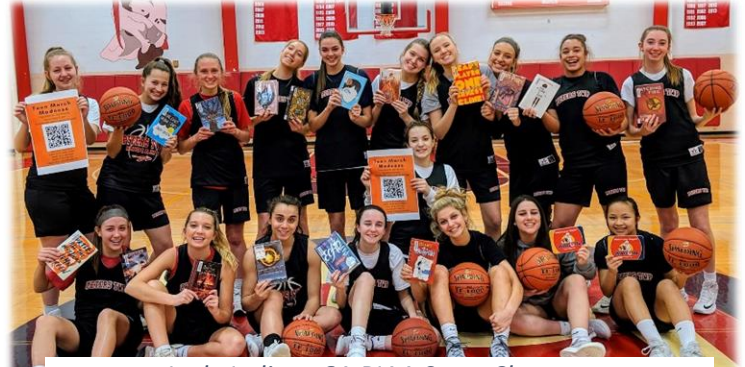
Lady Indians 6A PIAA State Champs

fun to market our efforts during the PTHS Girls Basketball season as they competed and won the PIAA State Basketball Championship Title. We also provided 100+ PT Middle School students with extra credit during their Shakespeare Week for viewing She's the Man at the library as part of their study of Twelfth Night .