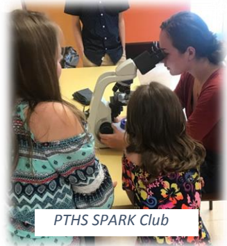
PTHS SPARK Club

Speaking of scientists, our PTHS Spark student-led April program introduced young girls to viewing plant cells under the microscope. Our PTPL neighbors at Studio Make also visited us with an activity for creative printing fun inspired by the popular book, The Dot , by Peter Reynolds.