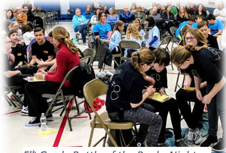
5 th Grade Battle of the Books Night