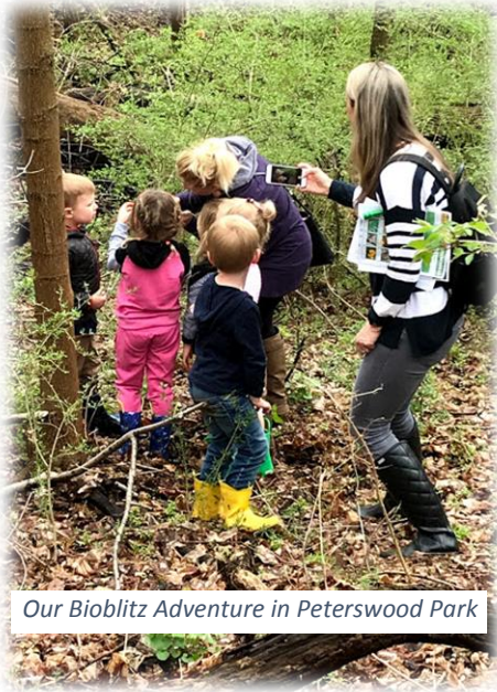
Our Bioblitz Adventure in Peterswood Park