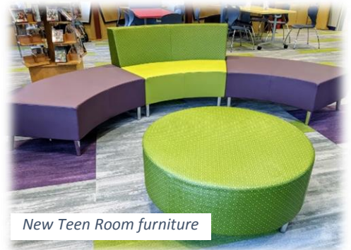
New Teen Room furniture

We loved having the third graders from Bower Hill Elementary School visit us this month to receive tours of our Youth Services Department highlighting what's ahead for summer learning.