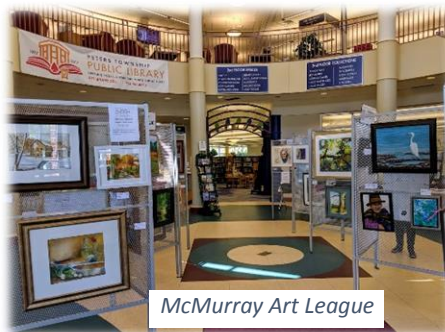
McMurray Art League