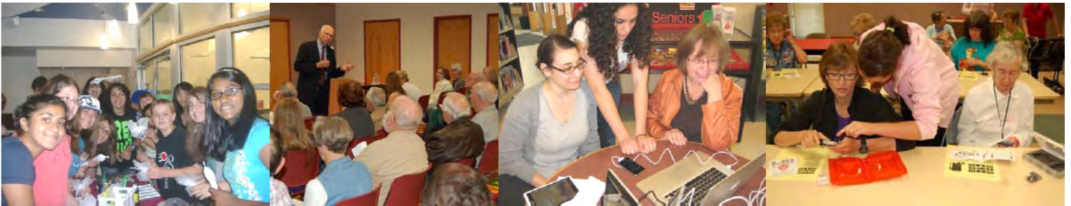
eREADERS • BOOKS CLUBS • WORLD AFFAIRS COUNCIL • KEENAGE KORNER • UNIVERSAL CLASS COURSES • FRIENDS OF LIBRARY