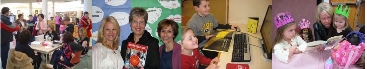
TECHNOLOGY • PERFORMING ARTS • SENIORS • BOOKS AND READING • LOCAL AUTHORS • GREEN LIVING • TEENS • PLAYAWAYS