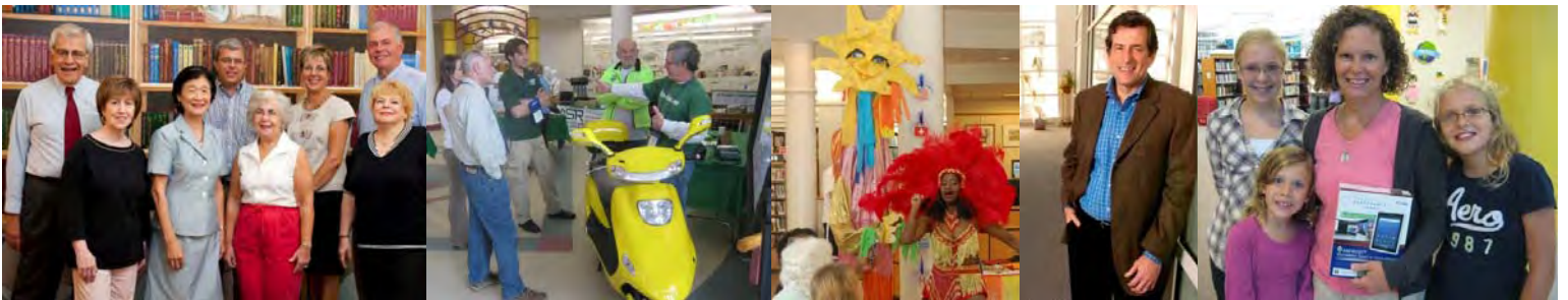
PA HUMANITIES COUNCIL • TASTE OF THE TOWNSHIP • TECHNOLOGY THURSDAYS • PATRONS • CHILDREN • SUMMER READING