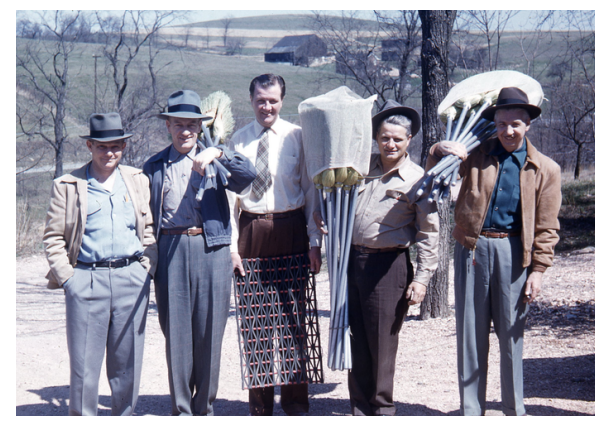
McMurray Lions Club broom sale participants, 1956 MS 2020.001